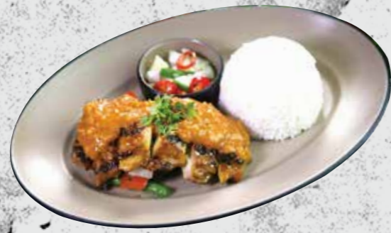
GRILLED CHICKEN WITH RICE G 15.9