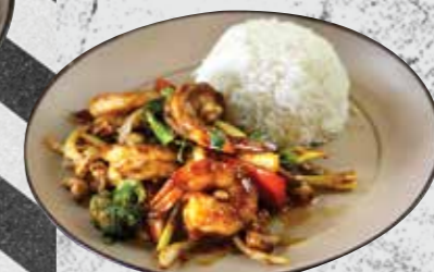
CASHEW NUT SAUCE