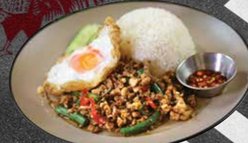
BASIL CHIKEN MINCE w/ FRIED EGG $17.9