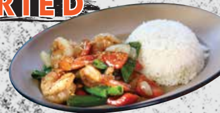
BLACK PEPER SAUCE