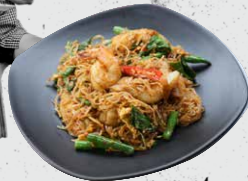
PAD KEE MAO G 17.9 Prawn (I) & Chicken