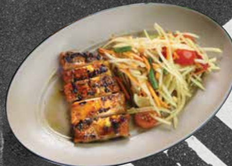
PAPAYA SALAD WITH GRILLED CHICKEN $16.9