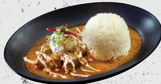
MASSAMUN BEEF WITH RICE G 16.9