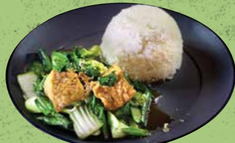
ASIAN GREENS WITH RICE VE 15.9