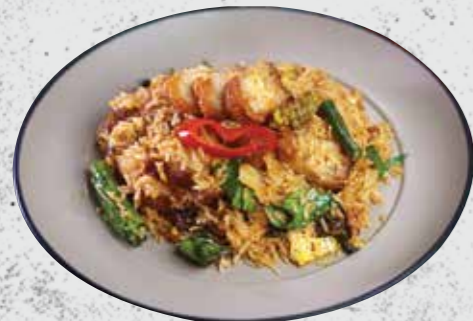
CHILLI JAM CRISPY PORK FRIED RICE 17.9