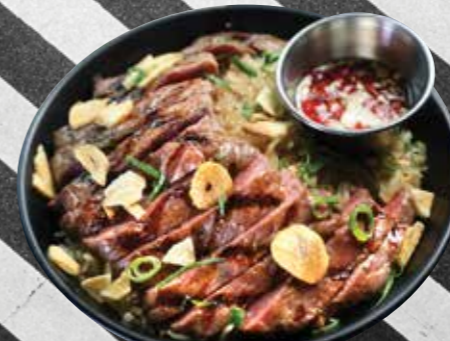
WAGYU BEEF w/ GARLIC RICE $19.9