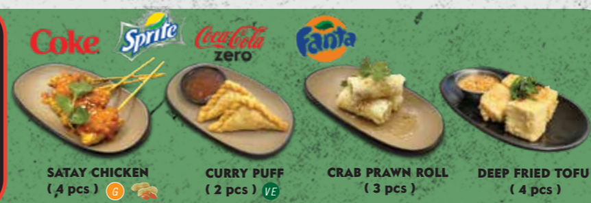
SATAY CHICKEN (4 pcs) G