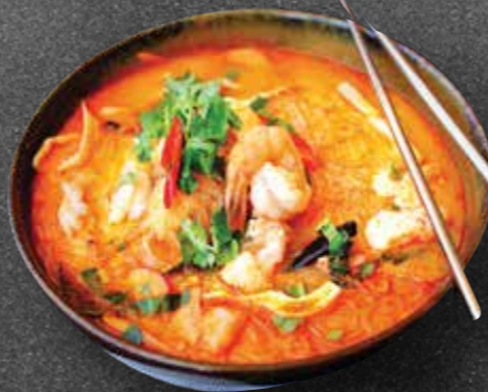
TOM YUM SEAFOOD (I) NOODLE G 18.9