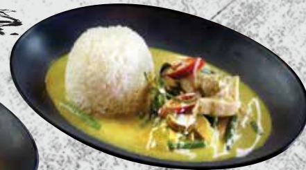
GREEN CURRY G