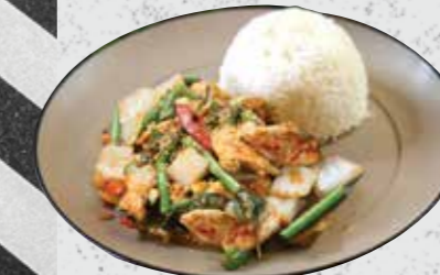
CHILLI BASIL SAUCE