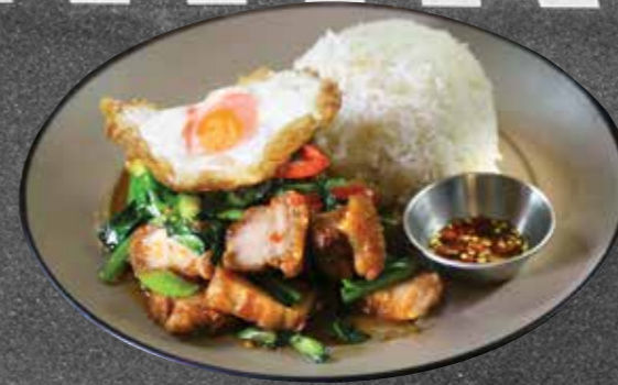
KA NA MOO KOB w/ FRIED EGG 18.9