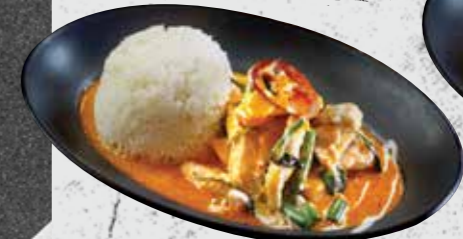
PANANG CURRY G