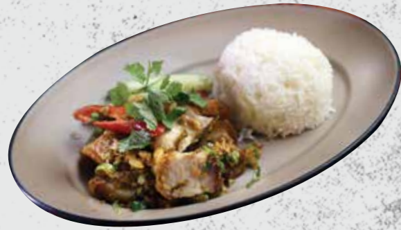
CHILLI GARLIC CRISPY PORK WITH RICE 17.9