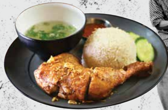
CRISPY CHICKEN WITH RICE 16.9