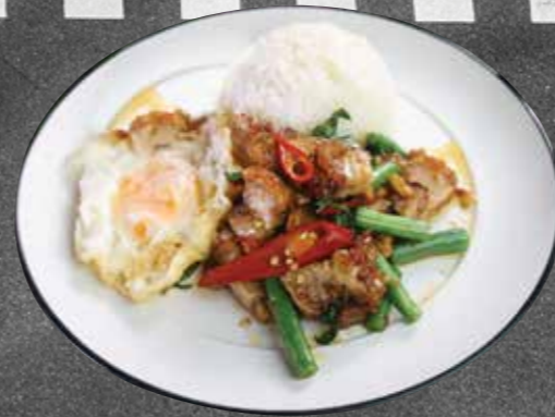
BASIL CRISPY PORK w/ FRIED EGG 18.9