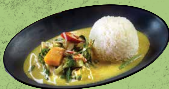
VEGETARIAN CURRY WITH RICE G VE 17.9